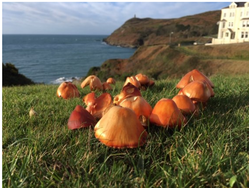
Crimson waxcaps, Hygrocybe punicea , on Port Erin Brooghs, 2020 (Photo Aline Thomas).

Please send your records to fungusiom@gmail.com .