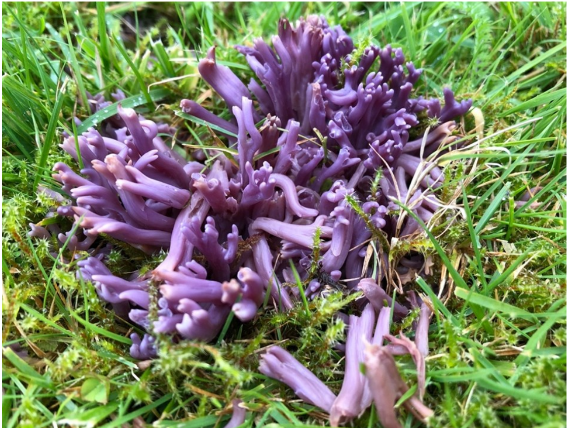
Violet Coral, Clavaria zollingeri, new to the Island, first found by a member of the group in 2019.