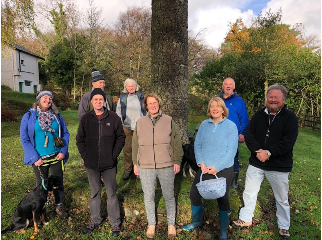
Isle of Man Fungus Group members in Dhoon Glen 2018 (photo Liz Charter).